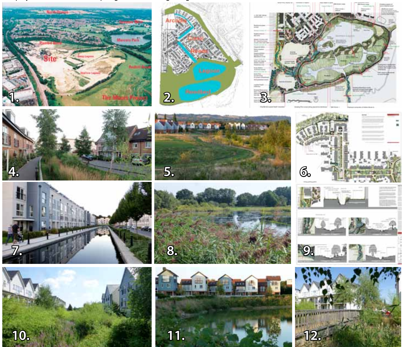
1. The quarry in 2004 2. The Blue Spine & Lagoons 3. Studio Engleback drawing for restored lagoons & Gatton Brook + link to Redhill Brook 4. Blue Spine 'Brook' 5. Restored Gatton Brook 6. Studio Engleback drawing for the Blue Spine 7. The Canal 8. Restored talings lagoon 9. Studio Engleback sections showing different profiles through restored Gatton Brook 10. Blue Spine 'Reedbeds' 11. Lakeside housing 12. Bridge over Blue Spine reedbeds

How – Transforming a desolate brownfield site into an attractive place to live and work in, bringing people closer to water processes is at the heart of the scheme in order to value, and better understand this resource. This is done as a linear parkway running through the scheme, as well as a restored brook and lakes that link the town to the nearby Country Park. CABE highlighted the quality of the landscape and restored brook as features that "set this scheme apart." The Landscape Institute is using this project in their latest exemplar guide on housing and green infrastructure.